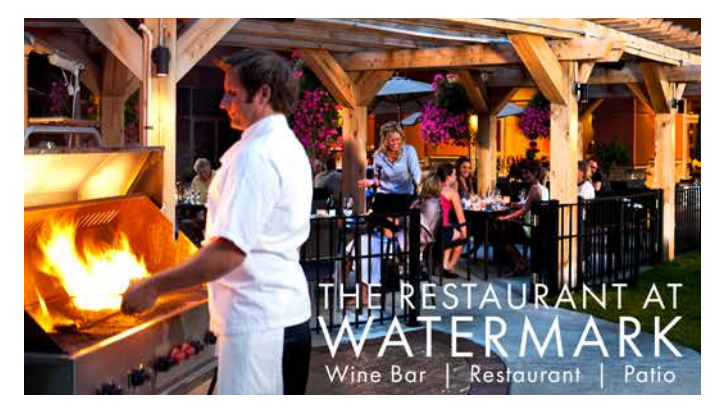
Nourish your senses with our South Okanagan Signature Farm-To-Table local cuisine paired with outstanding Award Winning wines.

Dissolve your stress by slipping into our hot tubs or seasonal saltwater pool. Treat yourself at the Levia Wellness Spa or Breathe Yoga and Pilates Studio.