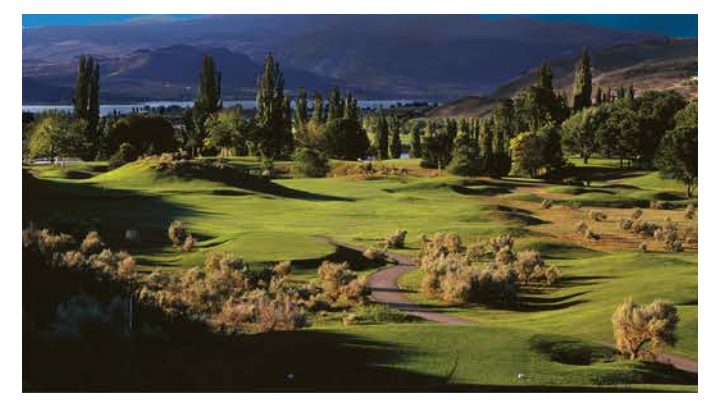
Experience the drama of desert skies, five championship golf courses and Canada's Warmest Lake at your door step. Breathe deep.

Whatever your interests, Watermark caters to a variety of regional activities. Cycle or hike Anarchist Mountain and the desert hills, or explore one of the many lush local vineyards.